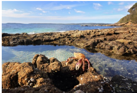
A picture of a rockpool.